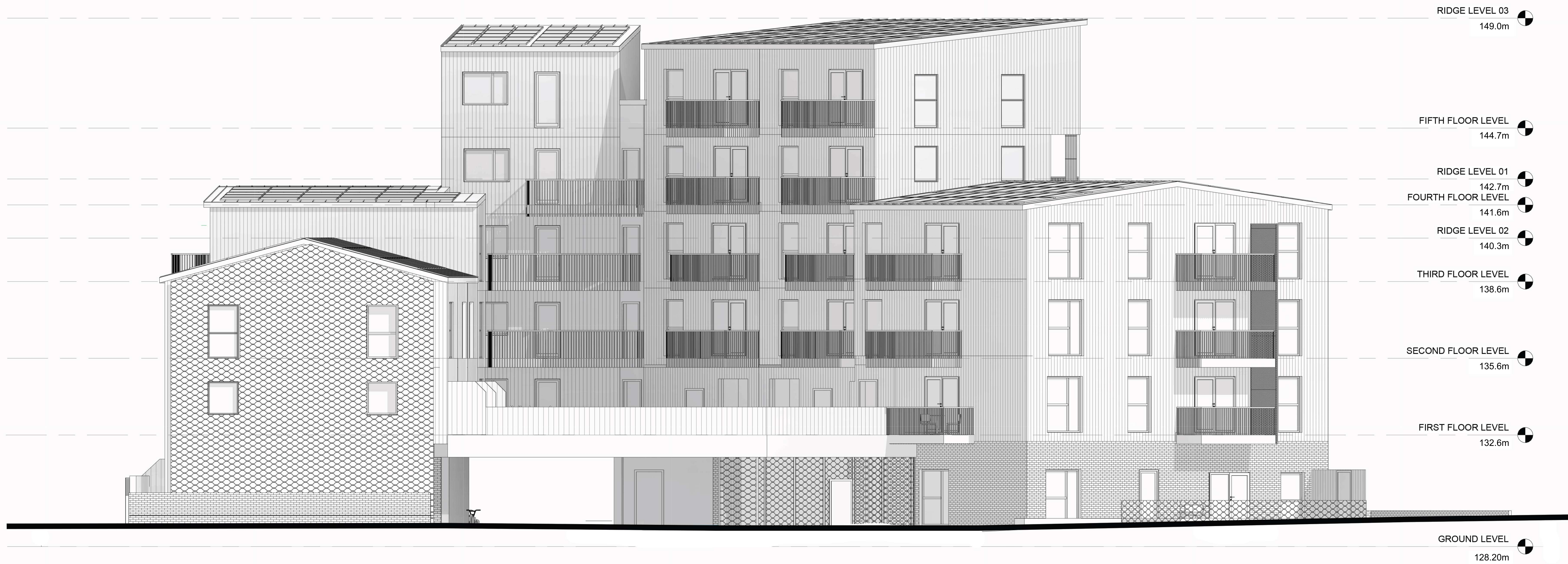
1 ELEVATION D 1 : 100