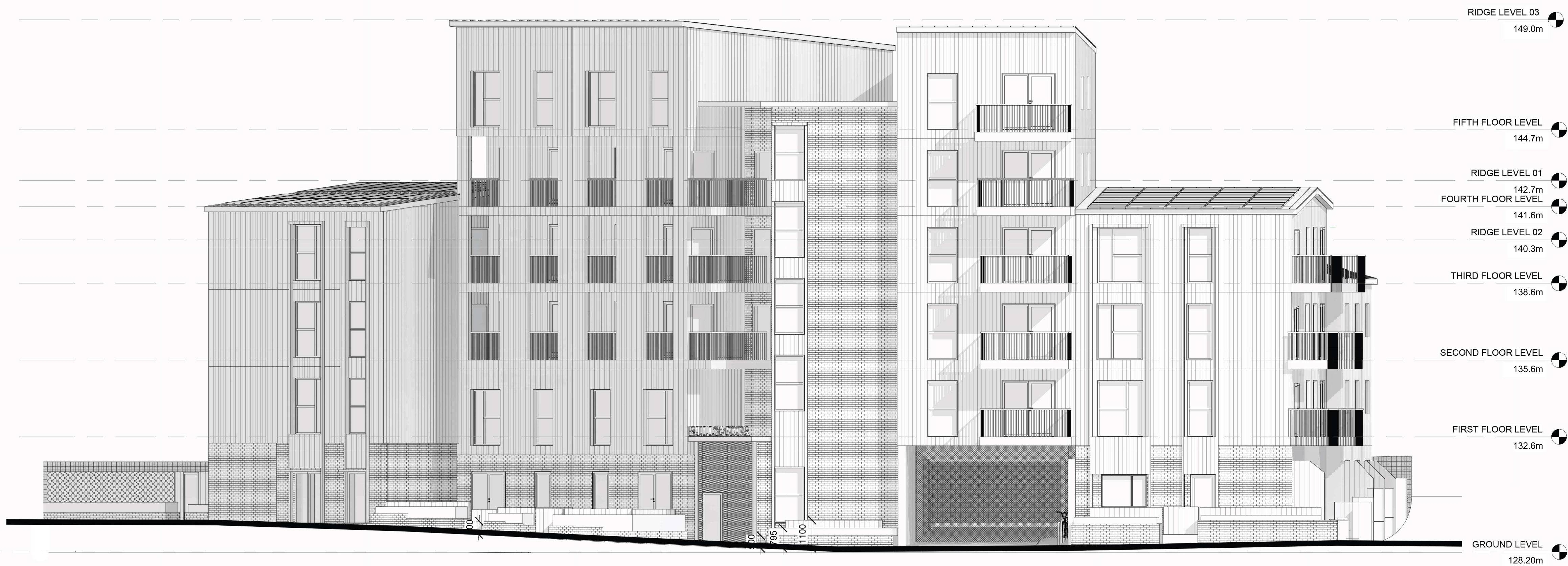
2 ELEVATION B 1 : 100